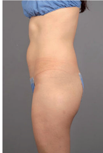
Fig. 3: Before and 28 days after treatment photos of 24 years old female, circumference reduction of 4.9 cm and weight change of 0.5kg

prior to focused US may increase the disruptive effect on adipocytes by increasing the dissolved gasses in the affected area (thus reducing the cavitation threshold for the ultrasonic wave). When used in this deep layer mode, RF application may also accelerate the clearance kinetics of the released triglycerides from the disrupted adipocytes by inducing vasodilatation and increased blood flow. Thus, the natural metabolic pathway in which triglycerides released from adipocytes treated by UltraShape and ultimately travel to the liver (5) may be accelerated.